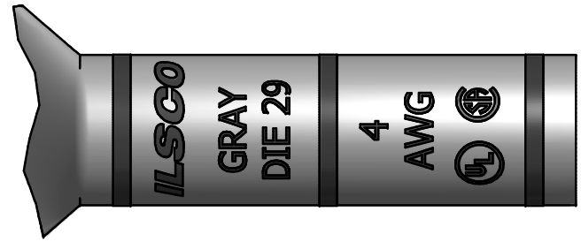
DETAIL E TOP & BOTTOM INK MART INK COLOR: GRAY