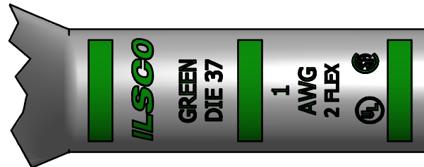
DETAIL E TOP & BOTTOM INK MARKING