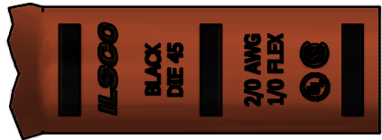
DETAIL E INK MARK TOP & BOTTOM INK COLOR: BLACK